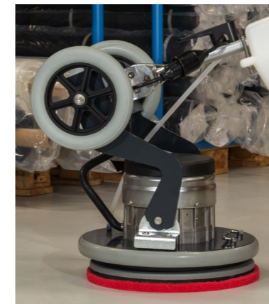
Tilting drawbar for increasing the contact pressure.