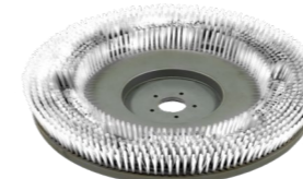
Brush medium Item no. 207.115

Disc pads for each surface in different degrees of hardness.