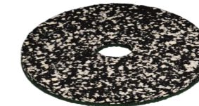
Power Pad for all surfaces Item no. 201.076