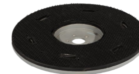
Pad holder Item no. 207.113