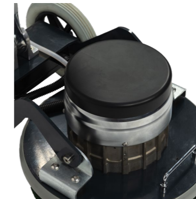
Motor protection cover protects the motor from moisture.