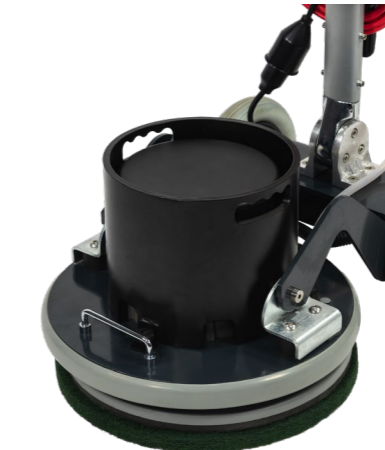
Optional additional weight, 12 kg Item no. 207.119