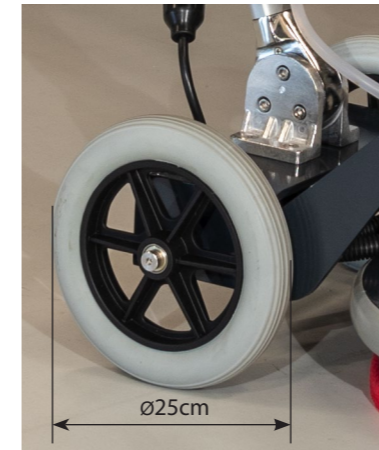
Excellent stairway mobility and stability.